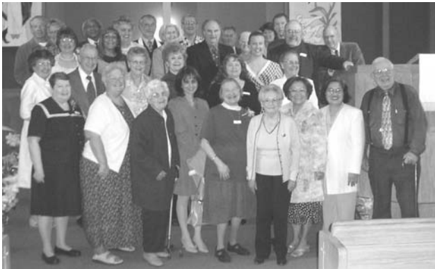
The Calvin congregation Easter, 2007.

This is an understandably sad occasion for the small congregation. Yet, the group has prepared itself and the Presbytery to go out "in style" with several special events in June. (See below for details.)