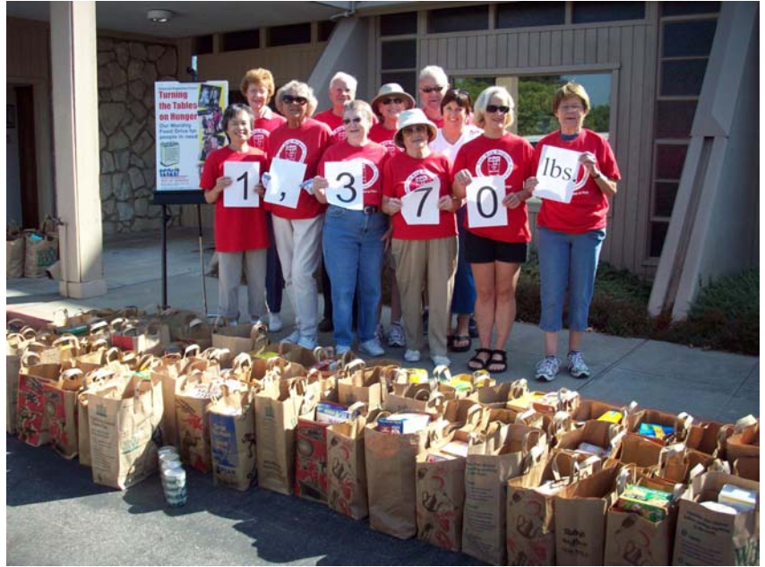
Senior Bag Brigade and sorted and bagged food from September Turning the Table on Hunger food drive.